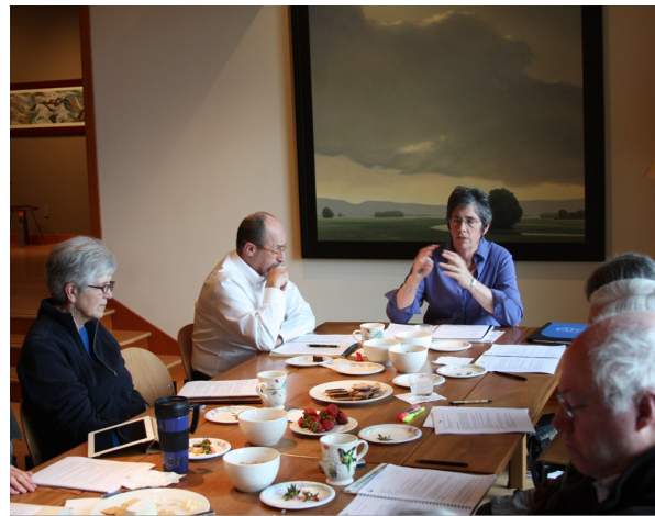
Our 2012 Evaluation Team

As the cycle grew and began receiving more applications over the years, BCF recruited volunteers from the community to participate in the grants review process —which included a review of the applicant's financials, an evaluation of the proposed project, and an interview with nonprofit leadership. BCF Board and staff members set up procedures and policies for the CGC, and they offered their guidance and knowledge of the community to help train volunteers.